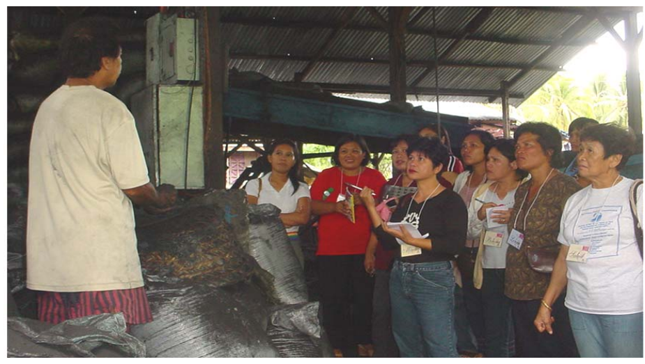
Women entrepreneurs in Davao del Norte province, Mindanao, Philippines, learn about processing charcoal for sale to commercial customers.